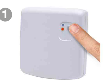
STAGE 1 Press and hold for 15 sec The red light will flash on for 0.1 sec and be off for 0.9 sec