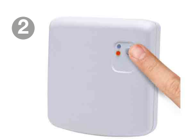
hold for 5 sec The red light will flash on for 0.5 sec and be off for 0.5 sec